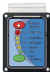
Control unit of modern design meeting the demands of the EMC directive